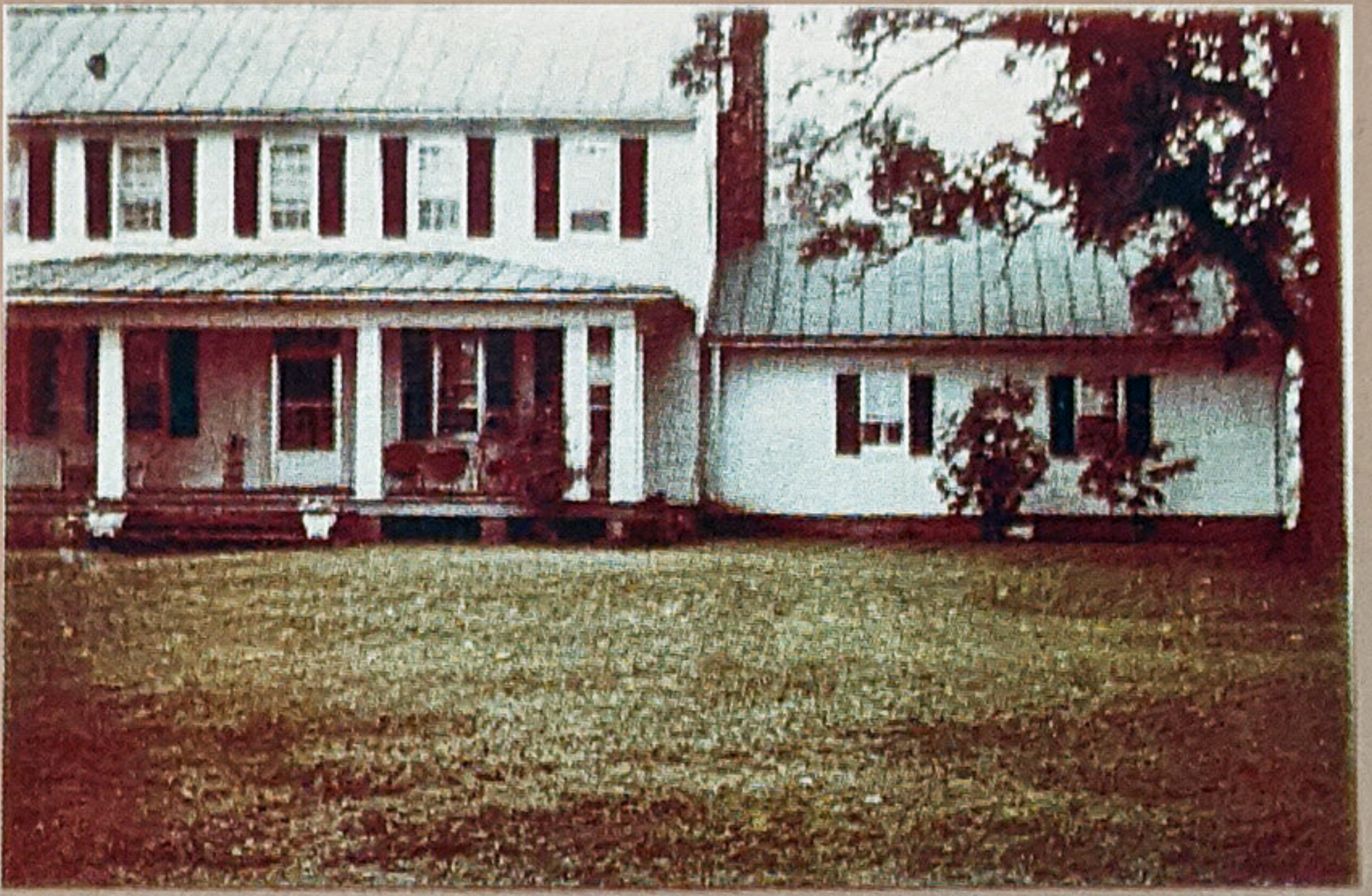
"Willow Hill" Arnold Home King George, Virginia