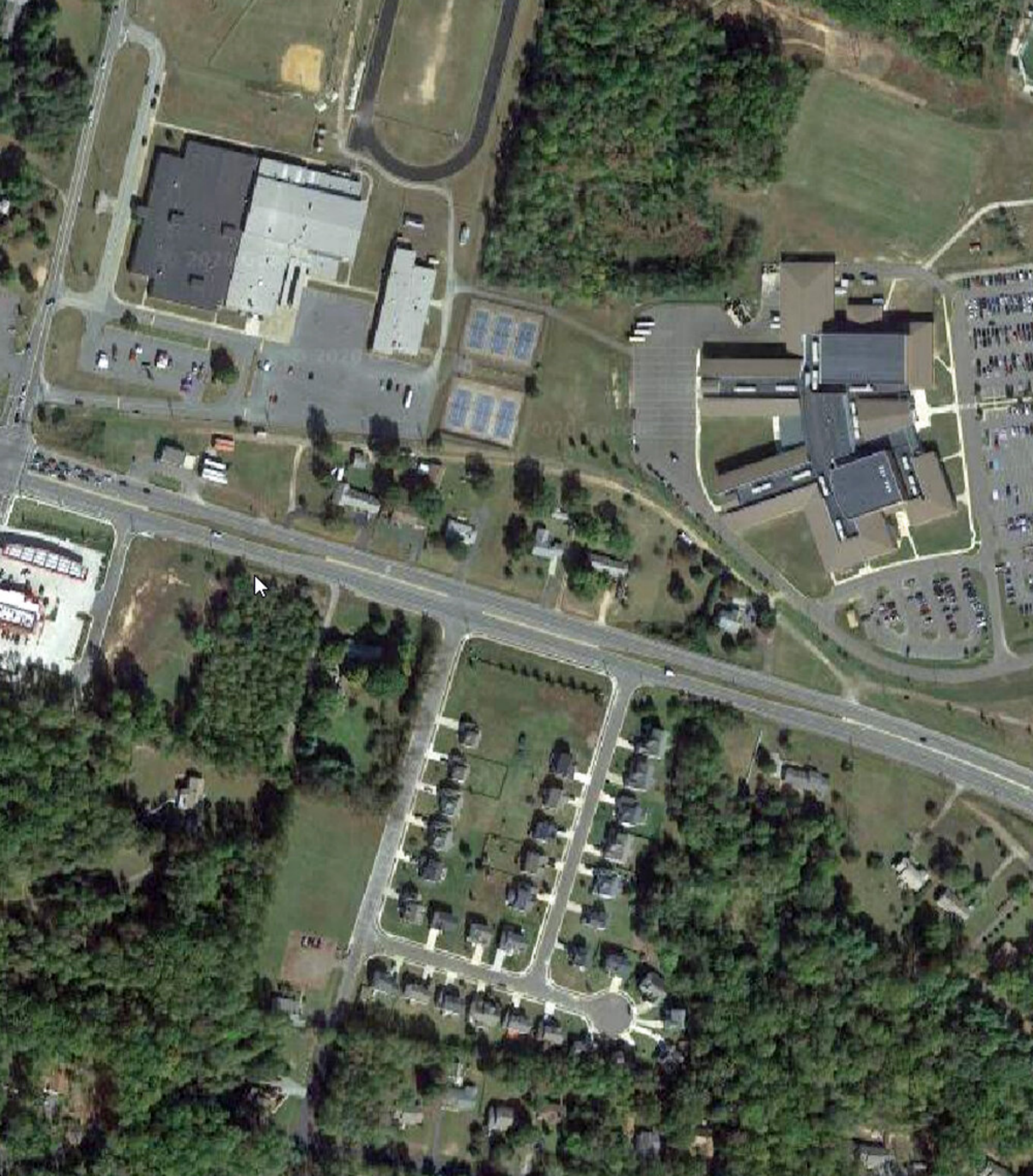
Willow Hill c.2019 Google Maps image