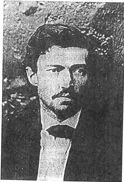
Samuel Arnold. As officials photographed most prime suspects aboard ironclad prison ships, the iron walls were clear in the background. However, neither Mary Surratt nor Samuel Mudd was held on the ships.